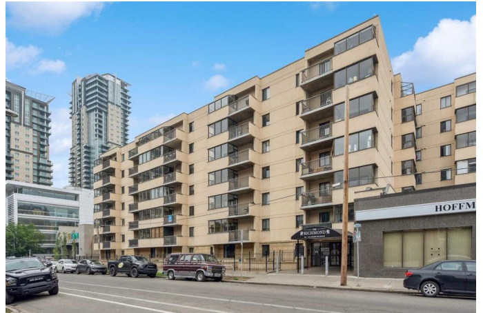
214 111 14 AVE SE - 06.12.2025 Main - 823.17 sq.ft / 76.47 m 2 RMS Area - 823.17 sq.ft / 76.47 m 2