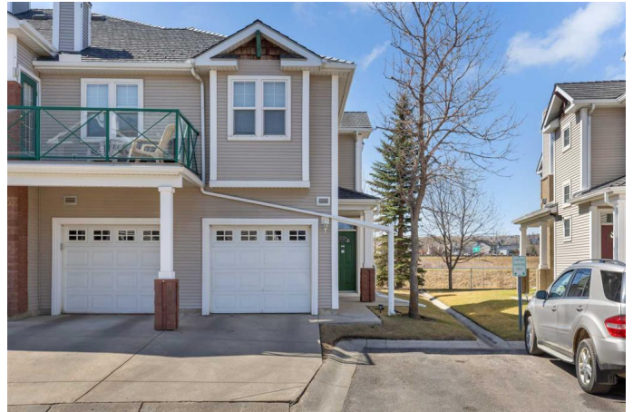
39 Hidden Creek Pl NW #304

Welcome to this beautiful end-unit in Hidden Valley's Hansen Creek Manor! West Backing onto a beautiful nature reserve with a freshwater pond and nestle in very conveniently located in a sought-after community of Hidden Valley NW. This single front attached garage townhouse is idle and perfect for those attempting to downsize into a quiet living space, surrounded by a welcoming neighbourhood with exceptional scenery and many walking paths. Also good for First-Time Home Buyers or investors to live or grow their equity. This home offer you ground floor single attached garage parking and 2nd floor quite living with the beautiful views from spacious and bright living room with cozy fireplace and dining. A very Bright and open concept floor plan loaded with two bedrooms and two bathrooms, open kitchen and dining, multiple pantries and closets. A big master bedroom with 4 pcs ensuite allow you to have your sound sleeps quietly. When the living room off the patio door the huge and sunny deck welcome you for the more sounding nature views and warmth for your summer BBQ to you and your guests. This home is very conveniently and closely located to the Schools, Gas Station, Small plaza with restaurant and other. Also only 2-5 minutes drive to Creekside Shopping Centre. A very easy and quick access to the STONY TRIAL allow you to drive to BANFF, EDMONTON and City-Centre wherever you want to. This home comes equipped with a stairlift for